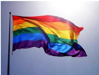
Rainbow Flag: A universal symbol of LGBT community.

Pride in the CLE: 1 st Weekend in June: http://lgbtcleveland.org/pride-in-the-cle.html